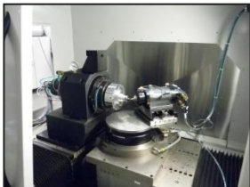
Oil Hydrostatic B-axis