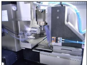
HD Vertical Grinding Spindle